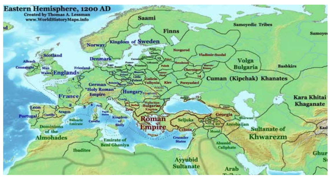
(T.A. Lessman; not to scale)

Great Power turnovers in the 12<sup>th</sup> century. The 12<sup>th</sup> century power narrative is notable for the rise of new powers and the revival of enfeebled old powers: Kara Khitai, Khwarezm, Georgia, Bulgaria, France. The Seljuk fragmentation becomes final. There is a turnover of Caliphates: Ayyubids displace Fatimids in Egypt, Almohads displace Almoravids in Iberia. Vladimit displaces Kiev in the Russias. The Holy Roman Empire churns itself endlessly, never enfeebled, occasionally aggressive.